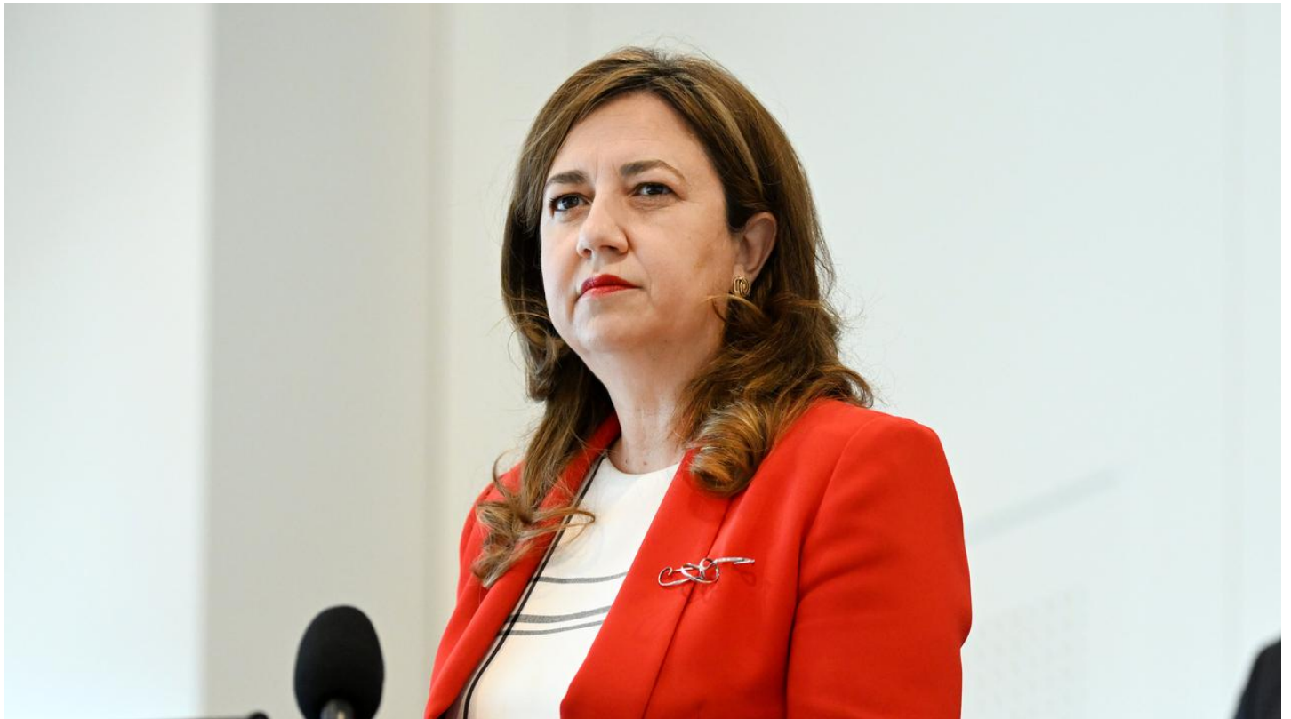
Premier Annastacia Palaszczuk on Friday said she had not read the report, which was tabled in parliament early last month.