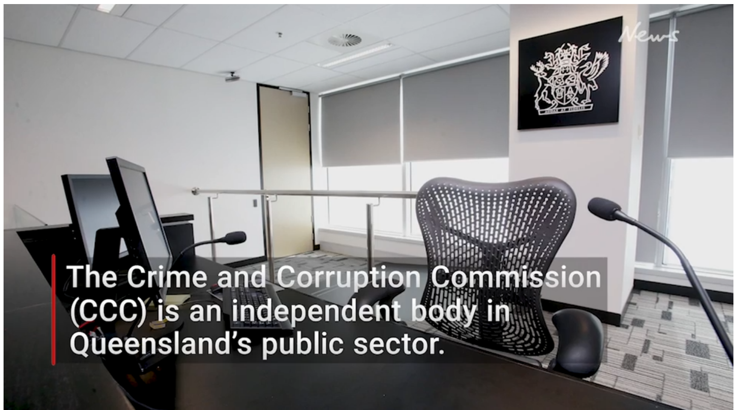
The Crime and Corruption Commission is an independent body set up to combat and reduce the incidence of major crime and corruption in the public